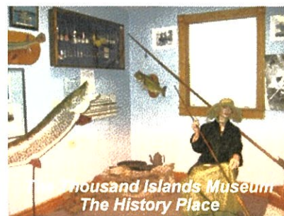
Thousand Islands Museum The History Place

Cancellation insurance is available & highly recommended; see reverse side for details.