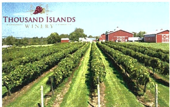
THOUSAND ISLANDS WINERY